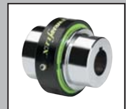
Falk™ Wrapflex Couplings