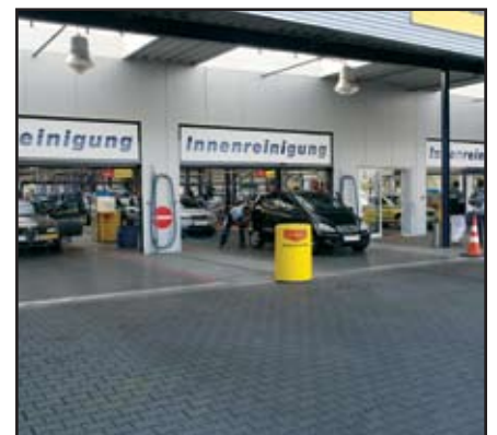
Rexnord® MatTop® chain for car care in a high capacity interior detailing operation conveying vehicles and people for increased productivity.