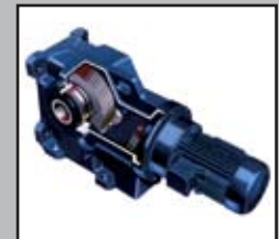
Falk™ Ultramite® Gearmotor and Gear Drive with UB Right Angle Helical Bevel

Ensure the highest operating performance for your car care conveyor by choosing Rexnord, your single source for car care conveying expertise, conveying chain, components and power transmission products.