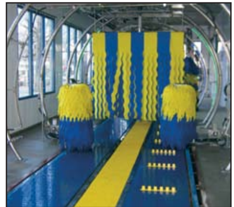
Rexnord 30 in wide 6995 Solid Top MatTop® chain with T2 pushers for quick, stable loading and unloading in exterior wash tunnels

Protecting cars from damage and workers from injury is are top priorities for car wash operators. With Rexnord 6990 Series MatTop chains in Solid or Safety Top, cars ride smoothly on the gently moving flat conveyor system without jerks or jolts. Guide rails are eliminated, preventing damage to tires and rims. Without guide rails, the conveying chain moves flush to the floor so employees work safely without tripping.