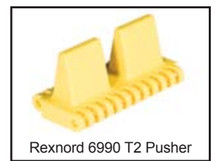
Rexnord 6990 T2 Pusher