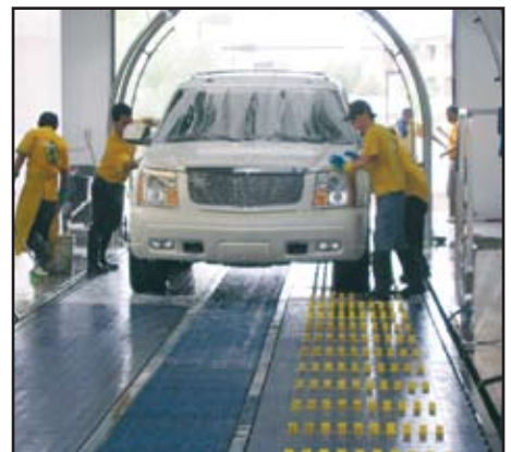
Rexnord 42 in wide 6999 Safety Top MatTop® chain with T1/T2 pushers in hand wash tunnels for ultimate safety in conveying cars and people